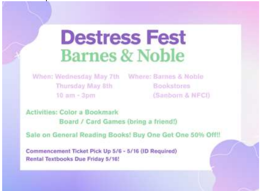
Figure 1 Destress Fest at Bookstore

NFCI students should make every effort to return their books to the NFCI store, but if absolutely necessary can utilize the drop-box on the Sanborn campus also.