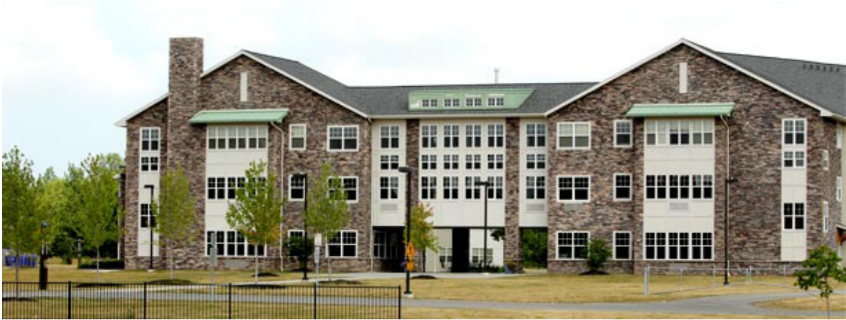
Student Housing Village