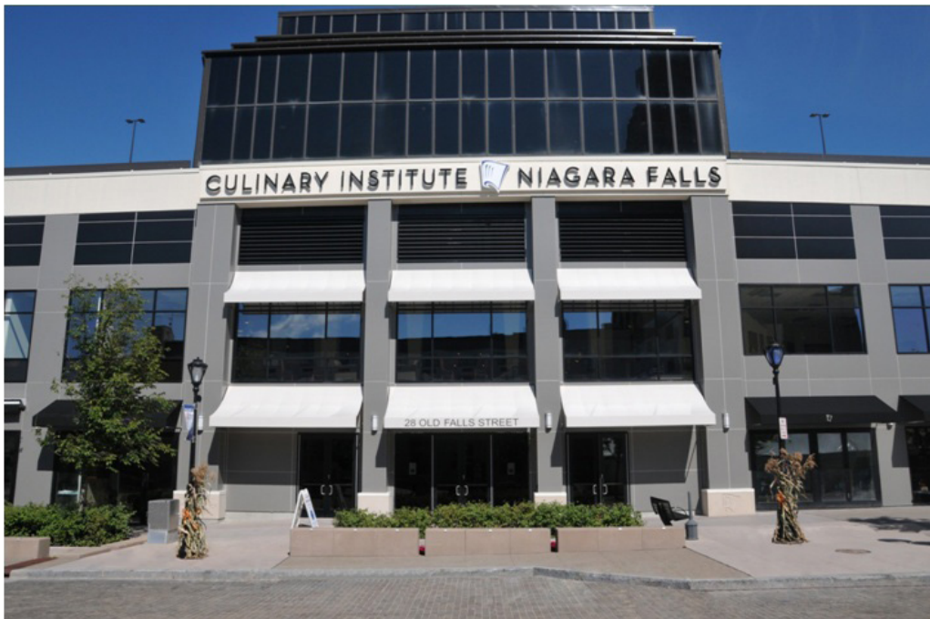
Niagara Falls Culinary Institute