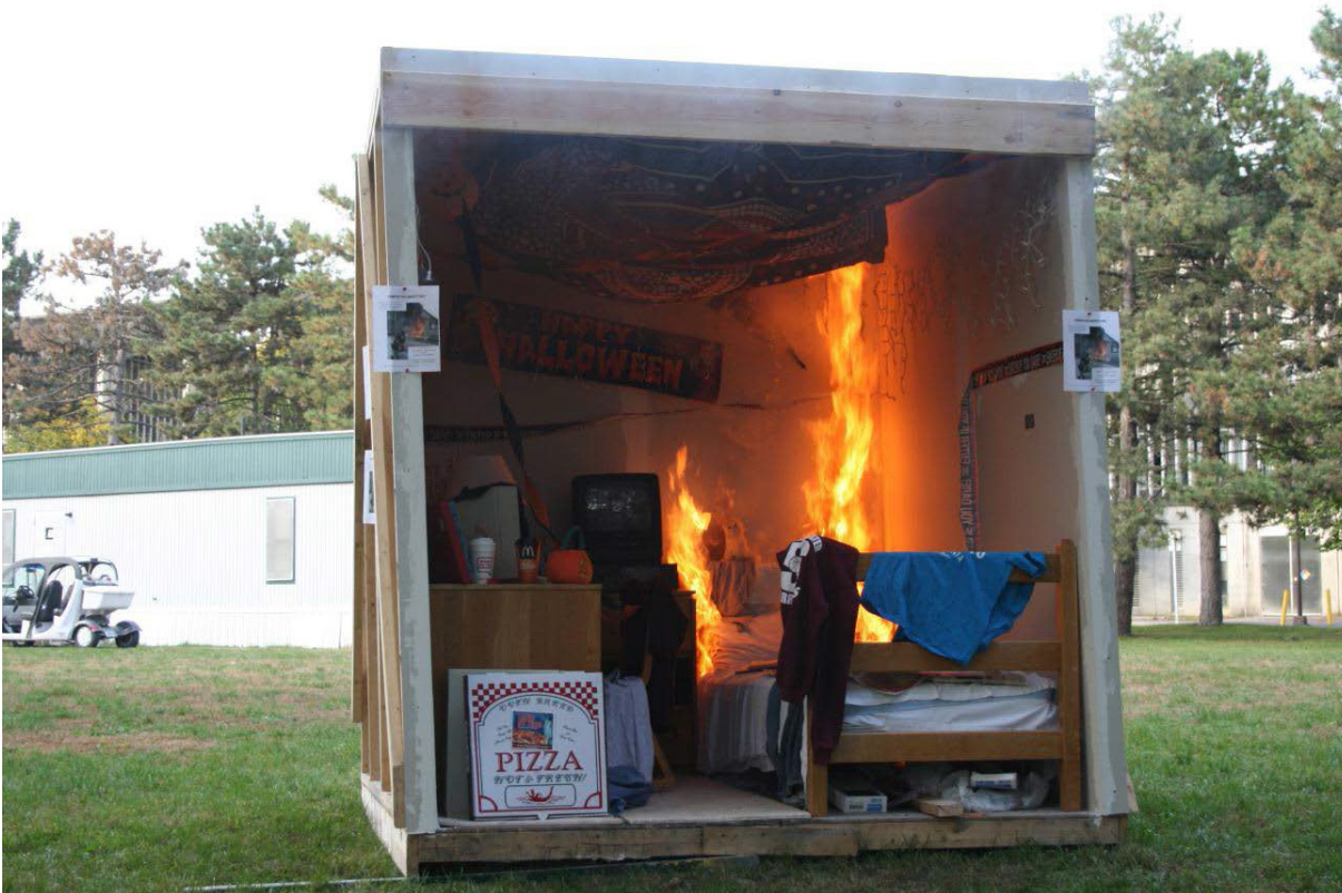
Picture of mock dorm fire